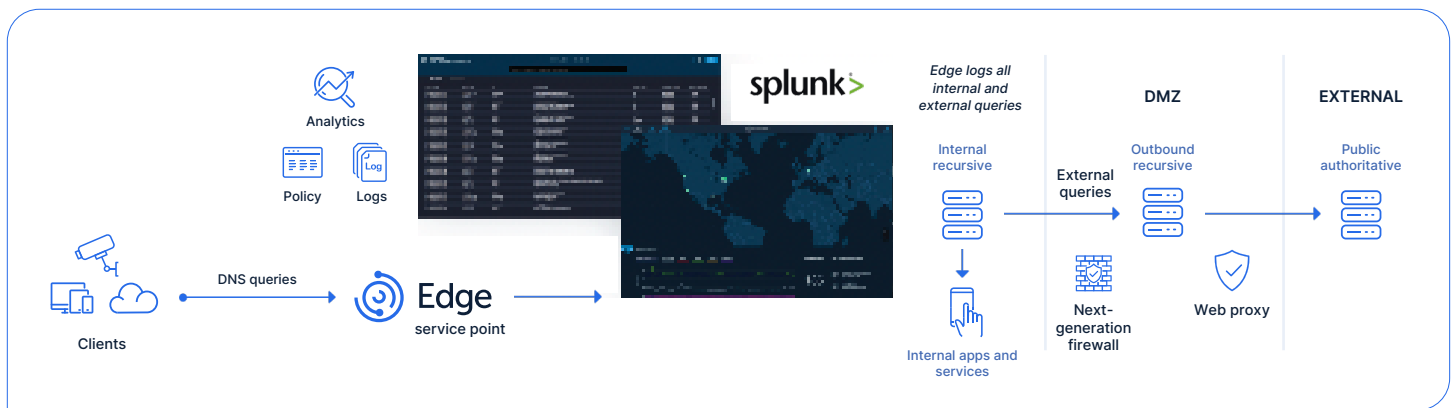
Figure 1. Edge resolution path